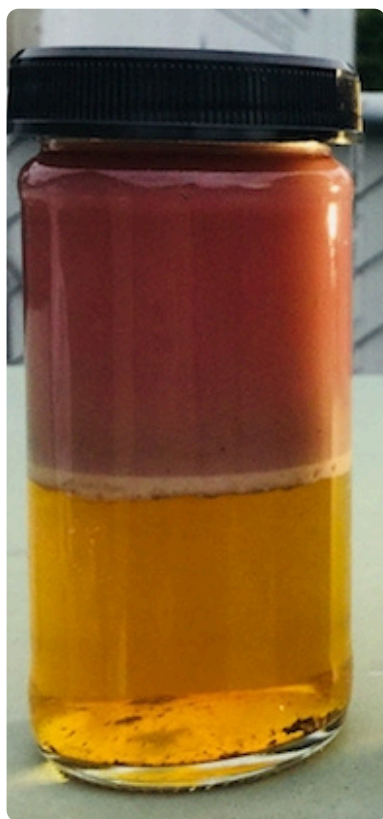
Diesel sample before service