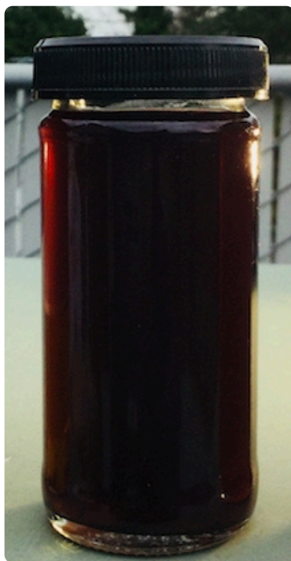
Diesel sample after initial cleaning (pump-off)