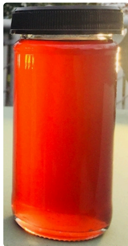
Diesel sample after dialysis service

Contaminated fuel restored to clean, usable condition in one service.